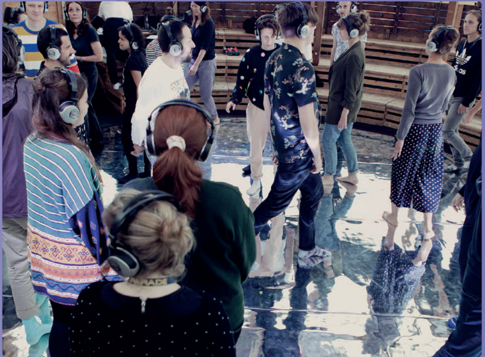
Image credits: Cover: POP-UP Duets (fragments of love) , Janis Claxton Dance Page 3: Family Heritage weekend, Brian Roberts Photography Reverse: OK Future by Paul Sixta